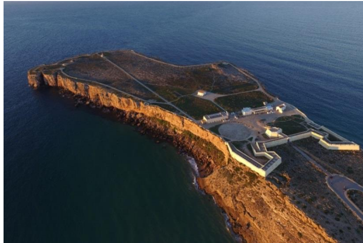
Figure 1. Sagres Fortress (aerial view)