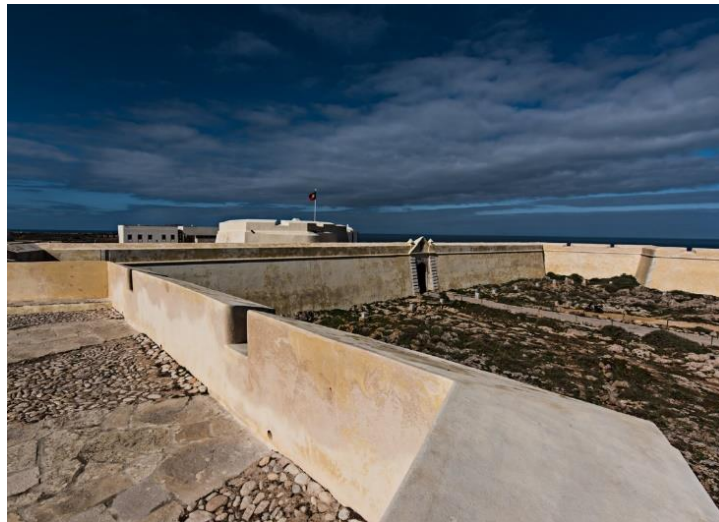
Figure 2. Sagres Fortress (Wall)

The beauty of the landscape is accompanied by a high mysticism that has been responsible for strengthening the place value all over the years.