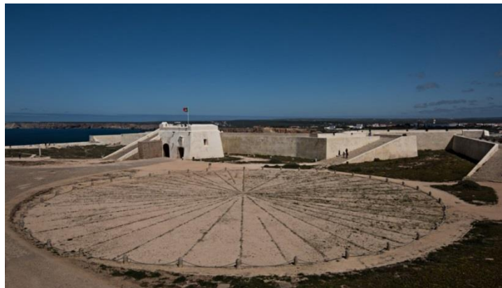
Figure 3. Sagres Fortress

Thus, for the fulfilment of its mission, it is imperative that the monument management reconciles two attitudes: on the one hand, to fulfil its public service role and to ensure that activities and initiatives emphasise and create learning opportunities related to the cultural, social, and educational aspects; on the other hand, to create a modern, dynamic and competent organisation, focused on the development of successful promotional and operational activities with a view centred on sustainability.