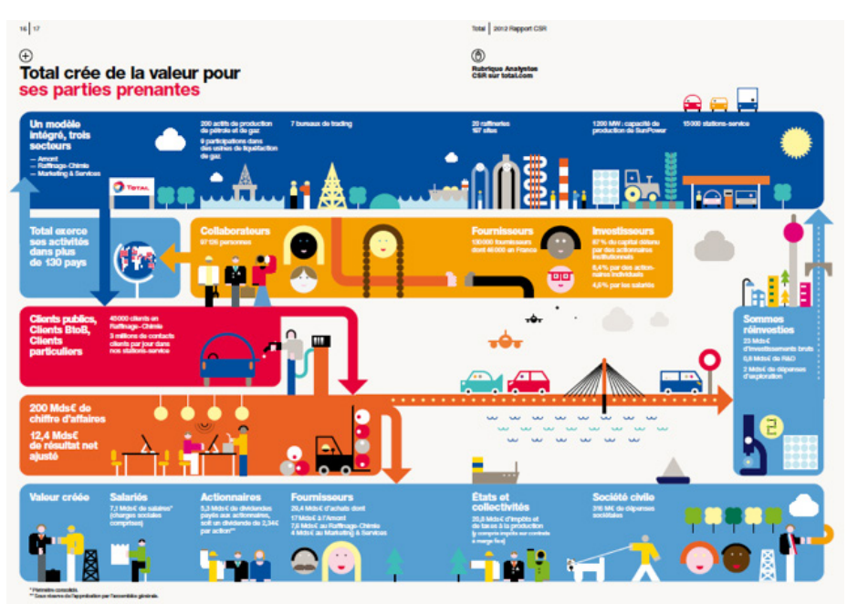
Figure 1: Rapport Sociétal & Environnemental 2005, pages 6-7, Total group<sup>8</sup>.

Visual aspects of CSR reports: a semiotic and chronological case analysis