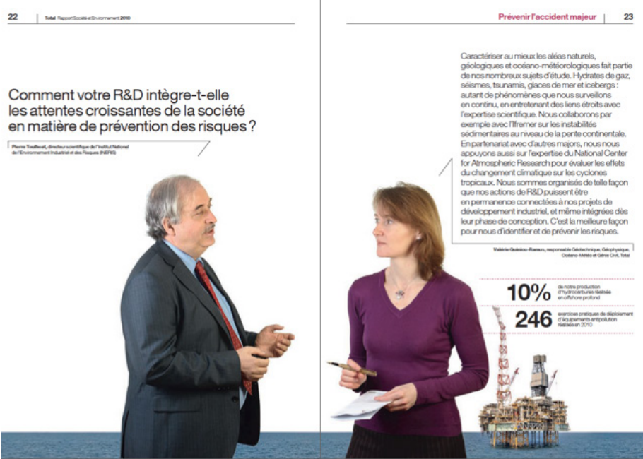
Figure 2: Rapport Société et Environnement 2010, pages 22-23, Total group.

This time each chapter opens with an image that takes up the whole double page: on the left side, a stakeholder presents a question (a student from MIT university, the director of a public institute in France, the director of another business which collaborates with Total, etc.); on the right side, Total is represented by one of its executive officers (the director of a local branch, of a business unit, etc.; see figure 2). The image shows the two characters looking into each other's eyes, even though the "meeting" is clearly not a real one, but the result of a photomontage, at least in some cases. The background of the image is also added via photomontage, and it is coherent with the subject of the chapter (for example, an image of the sea and an offshore platform at the beginning of the chapter on risk management).