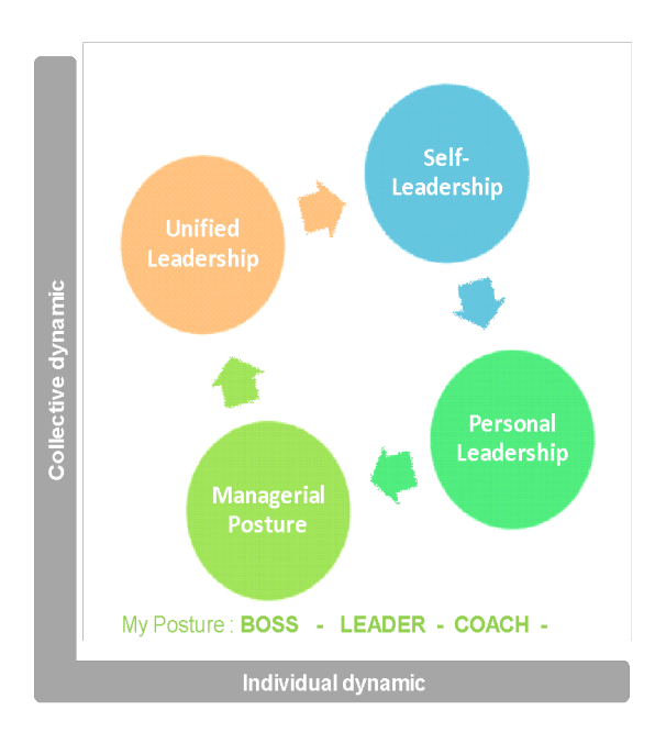
Figure 3: Deployment model of the self-leadership approach

In this framework change management consultants where hired; however the top management of the plant understood that in order for the human structure and mostly the management to completely adhere, be pro-active and lead the transformation, instead of just executing the steps and directions as obligations , they needed some more personal leadership. A self-leadership approach was proposed according to the following model: