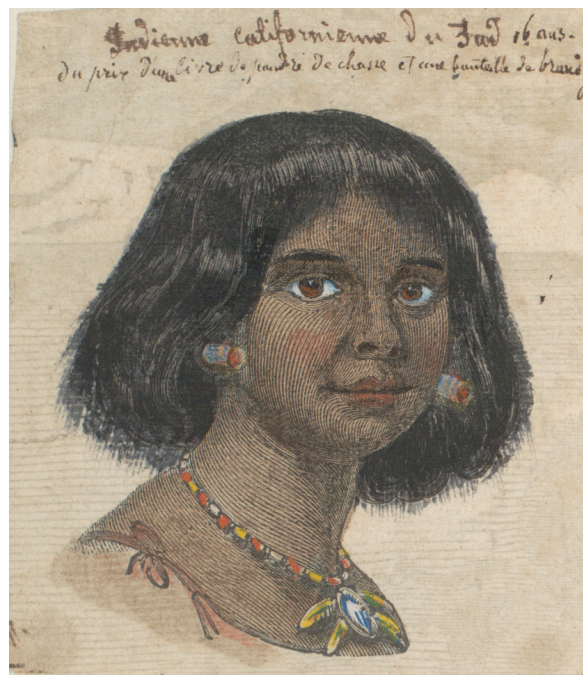
Figure 4 – Portrait of Indian Girl, author unknown. Banc Pic. 1963.002:1305:F-ALB, Robert B. Honeyman, Jr. Collection of Early Californian and Western American Pictorial Material, UC Berkeley, Bancroft Library.

Within a mission's colonial setting mother language loss and colonial language acquisition permeated and structured all daily practices. As Native peoples were exposed to the institution of the mission (Bolton, 1917) they retained Native habitual practices and traditions while embedding new routines and practices in repeated social actions and interactions. To contextualize and flesh out this process of structuration and the interplay between structure and agency (Giddens, 1984, p.14-37) let's consider the case of a missionized Native woman who marries a Native man according to Catholic Church rules.