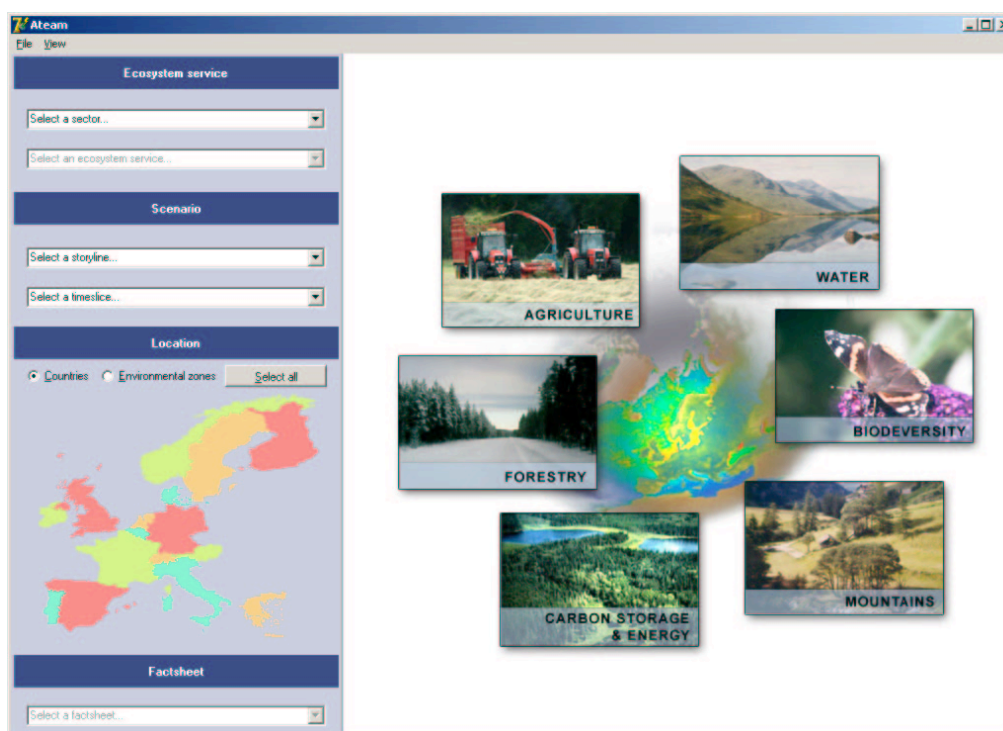
Figure 2. Menu of the ATEAM Atlas of European Vulnerability.

Practically, stakeholders reviewed and evaluated the methodology and some assumptions used in developing the land use scenarios and specific ecosystem models, as well as the temporal and spatial scales of the results. Stakeholders helped scientists to select and prioritise the indicators of ecosystem services for the assessment framework and to gain insights on how ecosystem services were recognised and managed. They provided invaluable information on the multiple facets and challenges of sectoral management practice and adaptation. They also enthusiastically supported additional exploratory case studies, particularly that on biomass energy potential (Tuck et al., 2006) and agricultural adaptive capacity (Reidsma et al., 2008).