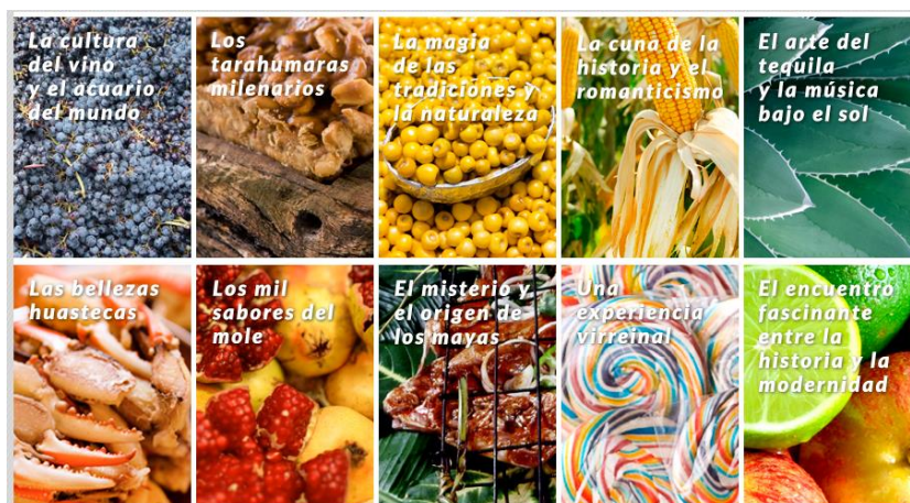
Figure 2. The Gastronomic Routes of Mexico