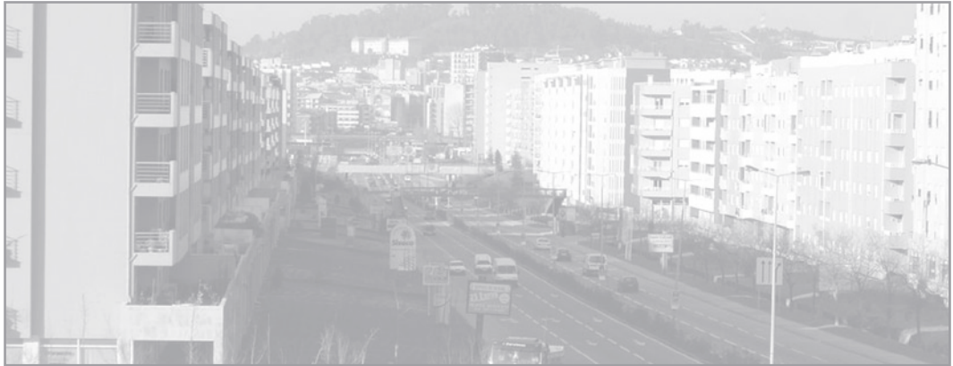
Figure 3: Flying across the city | Source: the author, Braga, Portugal, May 2006

Secondly, the “invasion” of urban or metropolitan areas on semi-rural areas, which already boast some urban characteristics, have been leading to a transformation of roads into streets with little infrastructures for pedestrians (Fig. 4). We can sense roads acquiring some characteristics of shopping ‘streets’, where people in cars can make “window shopping” – notably large furniture stores (many also small familiar furniture makers) and cars retailers, which require large amounts of display space. Thus we have roads or street-markets of great lengths along axes generally without a clear