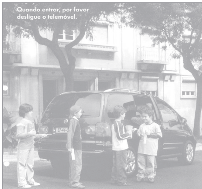
Figure 1: Cinema on the move

More recently, and as a result of the development of mobile technologies, the car has increasingly become a working place, a mobile office. Some car models, such as the Renault Espace , allow a rearrangement of the interior space and are easily transformed into offices. Still, various insurance companies require that costumers declare they use the car as an office, and surcharges apply to comply with the changes of use. The car should no longer be perceived as an isolation capsule where we travel alone (aren't people also alone in the middle of the crowd at subways and buses?), but increasingly cars are places of communication. We talk to relatives and friends, we take calls using Bluetooth technologies (and those who do not use them are fined but continue to do so).