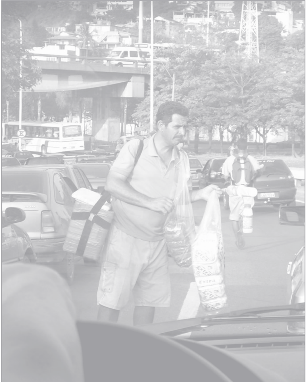
Figure 6: A daily working place | Source: the author, Rio de Janeiro, Brazil, October 2006