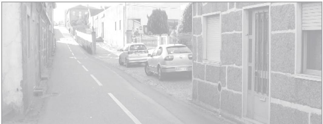
Figure 4: Are they streets or roads? | Source: the author, Covas, Guimarães, Portugal, October 2005

continuity 10 . In the northwest of Portugal these roads/streets have grown organically, lacking any spatial planning. They seldom comprise parking lots at the back of stores, and are mingled with industry, warehouses, residential houses and agricultural fields, originating circulation problems due to illegally parked cars. The commercial units along these streets generally lack elegance and quality, and therefore do not function as renovating generators. As mentioned, there is little continuity and sense of cohesion between the various businesses 11 .