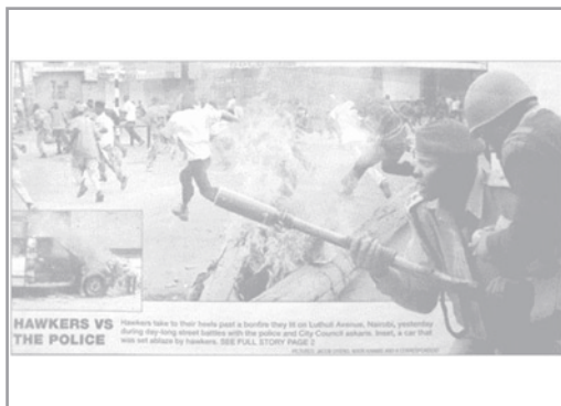
Figure 3: Police clash with Hawkers on the Streets of Nairobi, June 2006

bars, truncheons and axes is commonplace during these disturbances. One policeman and two hawkers were killed during these confrontations and the level of sustained state-sanctioned violence against this group of urban entrepreneurs was intense enough to mean that by the middle of 2006, for the city for the first time in a generation became ‘hawker free’ and largely remained so for almost 18 months. The ‘hawker menace’ had been removed, temporarily it turned out, as just two months before the 2007 election street traders were permitted to come back into the city centre again, in a bid to ensure support for Kibaki’s bid for re-election. However, the logic of claiming the city centre for ‘legitimate business’ and as a basis for Kenya’s bid to create a new globally integrated, ‘World Class’ city remains in place. As I write, street hawkers again face expulsion – some to take up a limited amount of trading pitches in Muthurwa, in the only market completed in the Nairobi in over a decade, but most, once again, will be deprived of their livelihoods and will be forced to depart into those spaces of urban oblivion beyond the neo-liberal urban imaginary.