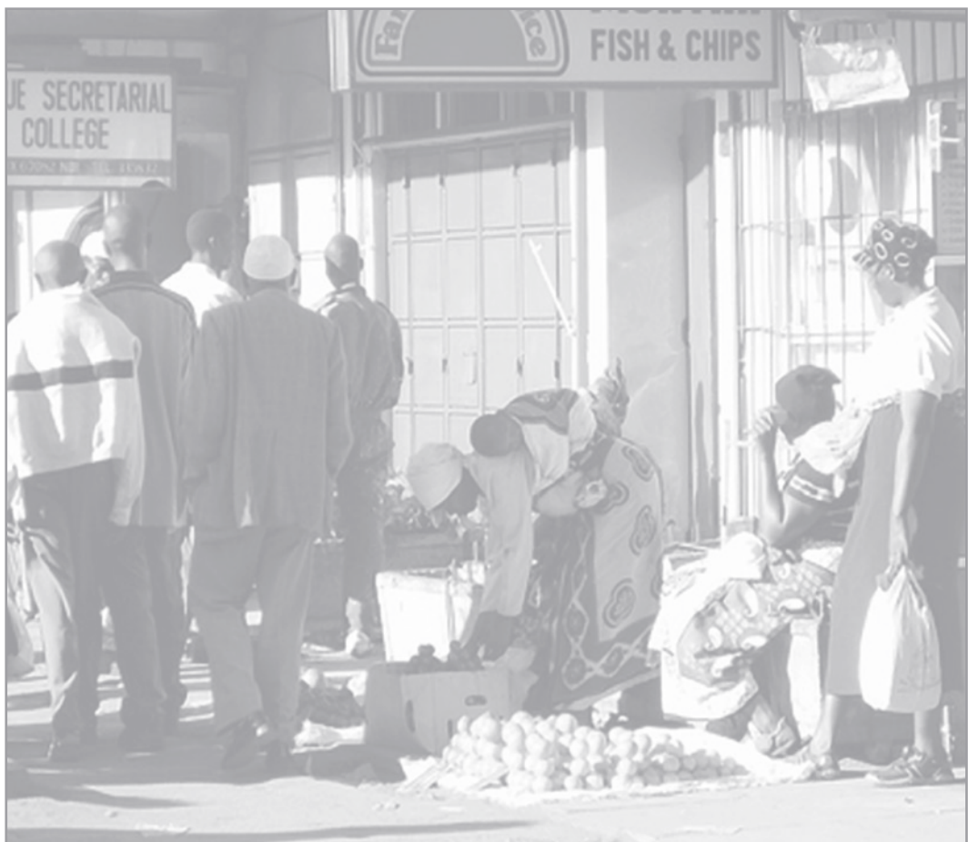
Figure 1: Fruit and Vegetable Street Hawkers, Nairobi, January 2007

the Global South, these needs and rights of these informal workers often confound formal and traditional mechanisms in urban planning, are not safeguarded by legal or social protections, and face persistence erosion of their rights and expulsions from public space (Bass 2000, Yankson 2000). Their experience in the context of accelerating urban forms of neo-liberalism presents an opportunity to interrogate the key actors and processes which are currently shaping the urban geographies in contemporary Africa (Fig.1).